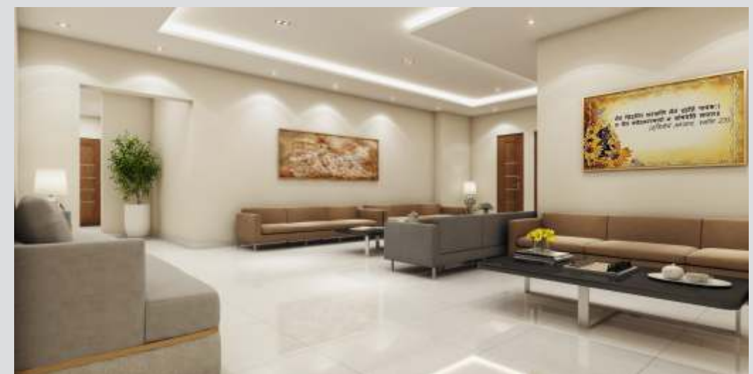
Senior Citizens Lounge