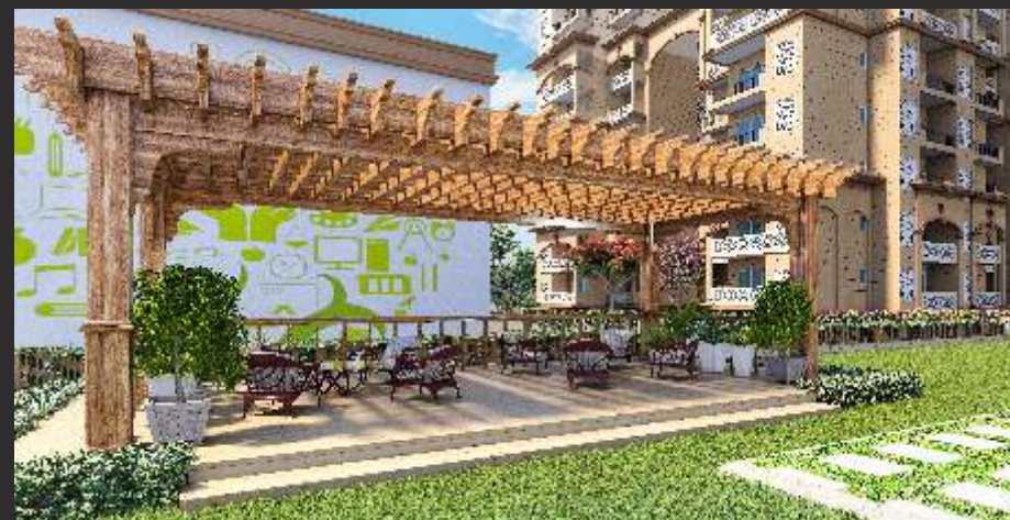
Open Sitting Area