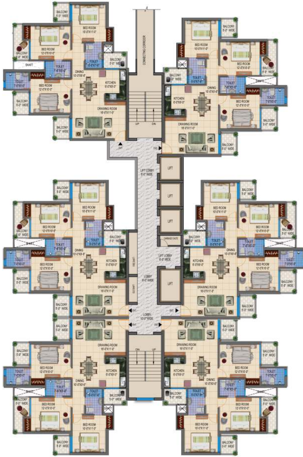
TOWER - F & G TYPICAL FLOOR PLAN

3 BHK + 3 TOILETS (TYPE - 3) CARPET AREA = 80.19 sq.mtr. (863 sq.ft.) BUILT UP AREA = 107.53 sq.mtr. (1158 sq.ft.) SUPER AREA = 138.90 sq.mtr. (1495 sq.ft.)