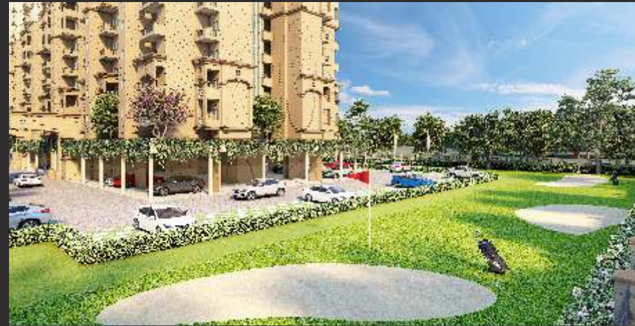
Mini Golf Putting