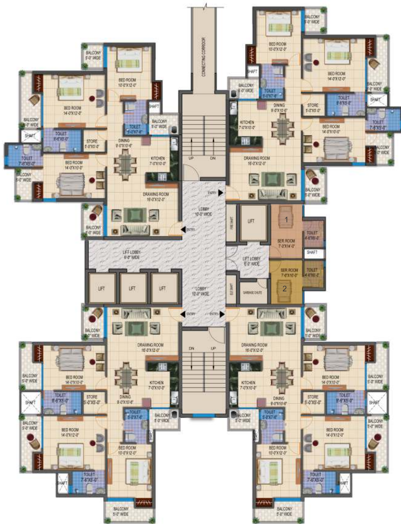
TOWER - C & E TYPICAL FLOOR PLAN