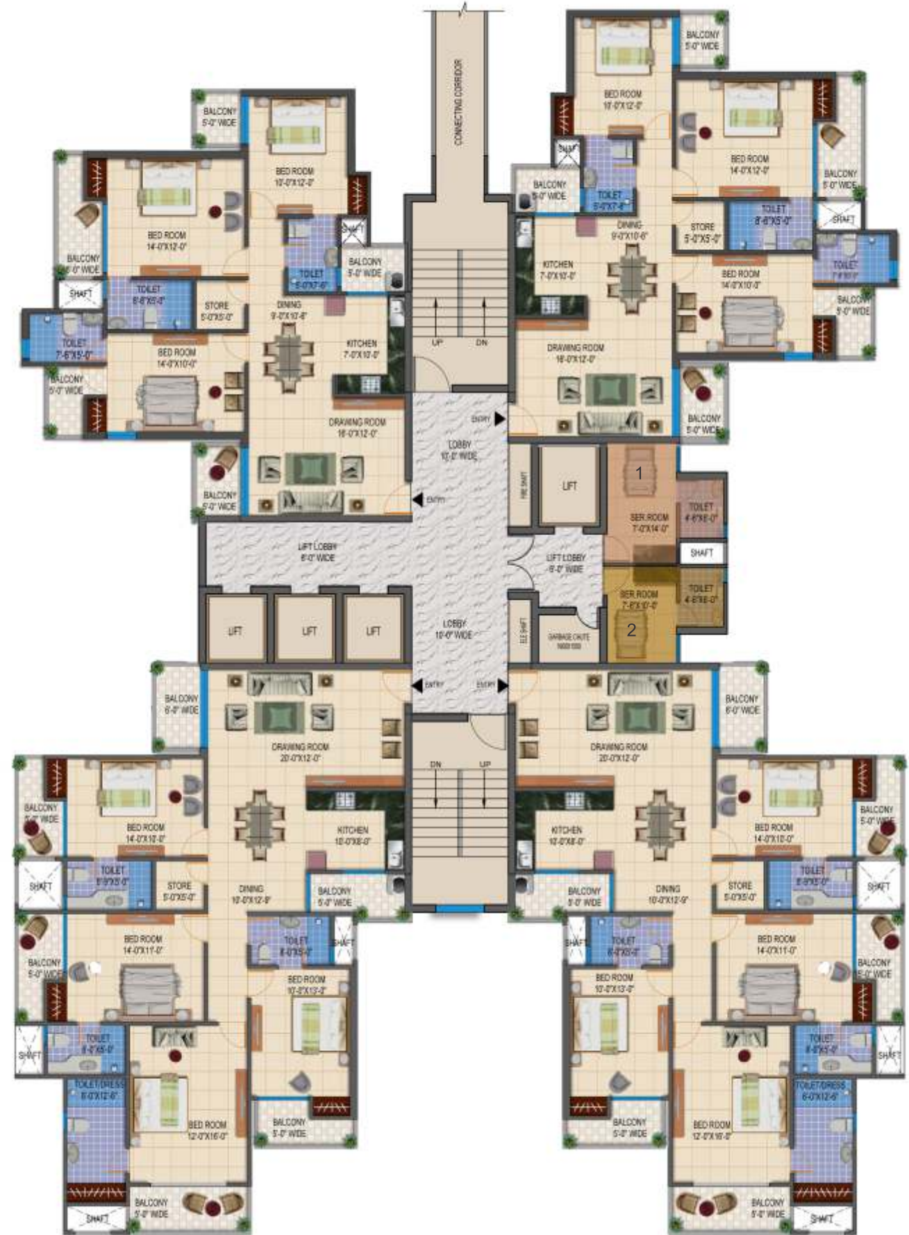
TOWER-A & D TYPICAL FLOOR PLAN