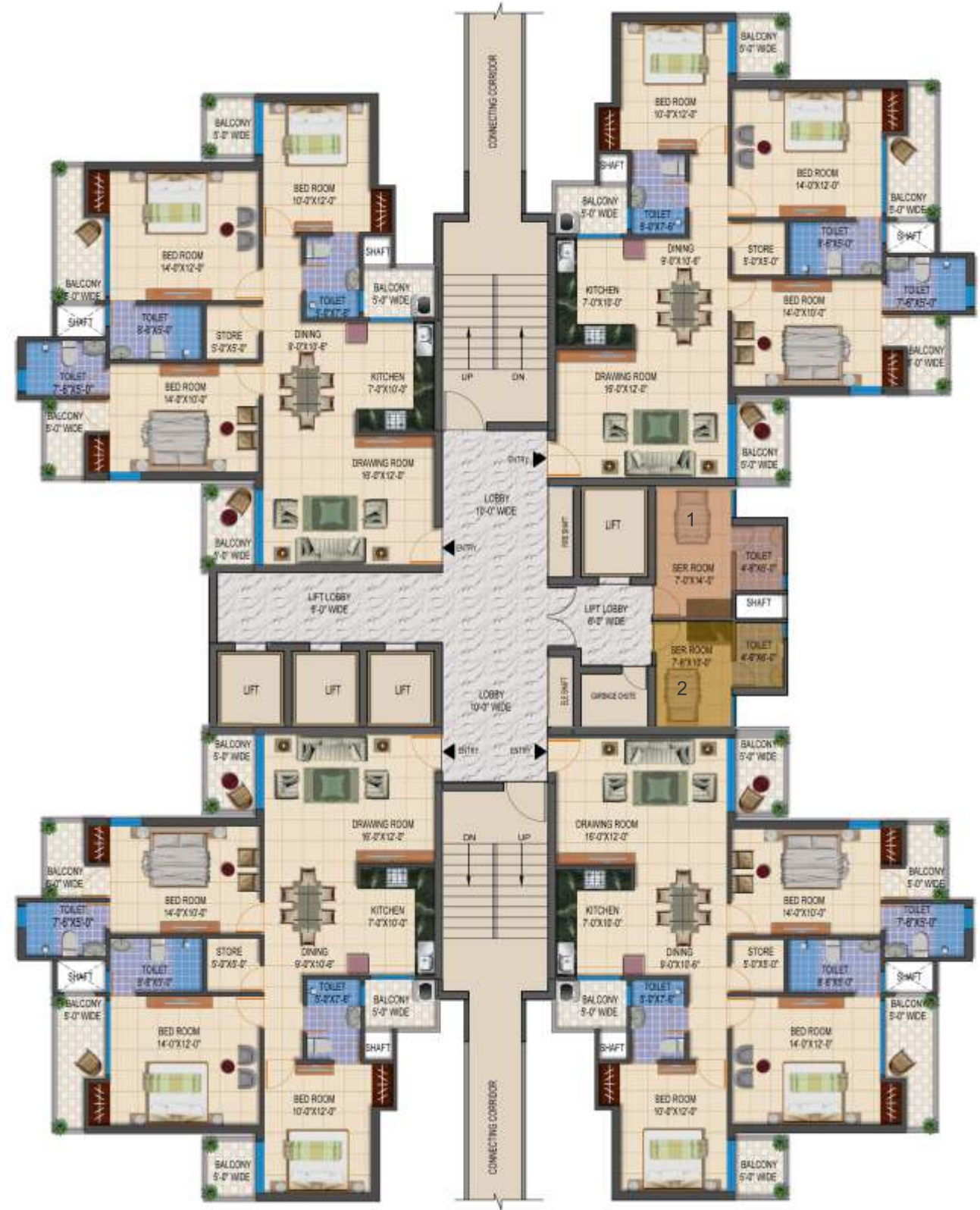
TOWER - B TYPICAL FLOOR PLAN